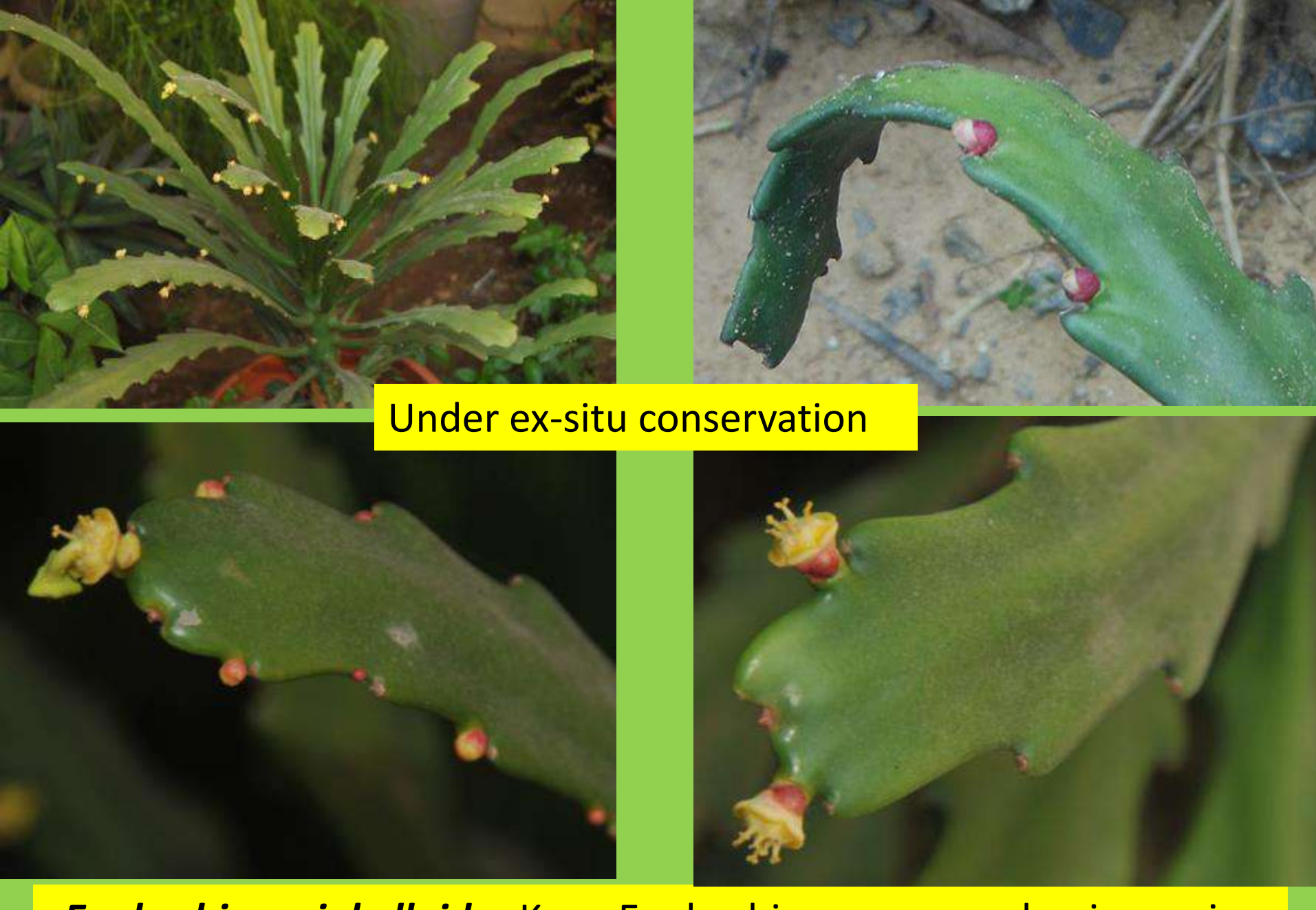
Euphorbia epiphylloides Kurz. Euphorbiaceae -an endemic species