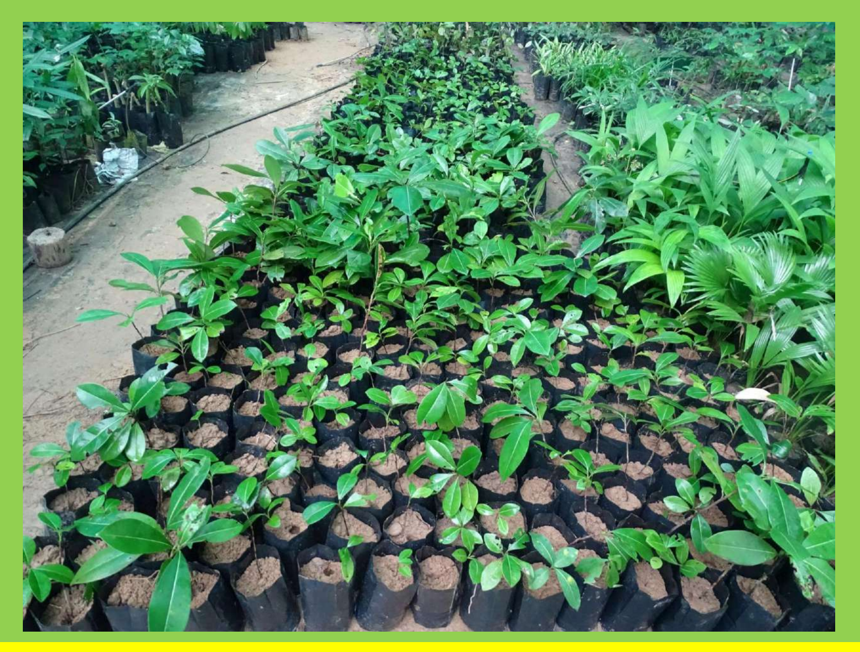
Seedlings raised in the nursery